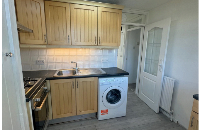
398 sq.ft. (36.9 sq.m.) approx.